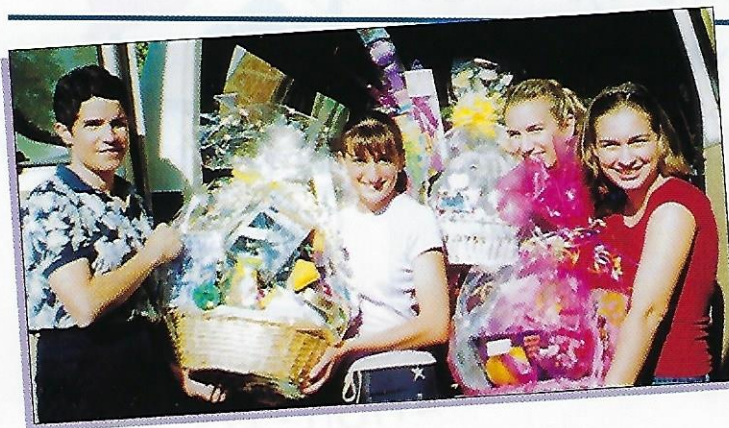
S tudents at St. Lucy’s Priory High School donated 70 Easter baskets for the children in residential.

Your contribution in the amount of $35, $75, or more, will go toward the purchase of baseball equipment and other sporting equipment for our McKinley children. Your contribution will take our kids on field trips and fun educational excursions to amusement parks, museums, zoos and day camps. No childhood would be complete without a day of deep sea fishing, or lake canoeing. Please make a donation, today. Make a special memory – for the children, and for you.